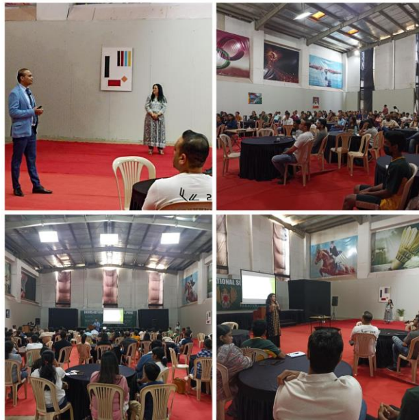
Workshop for Grades 8 and Grade 9 Students & Parents