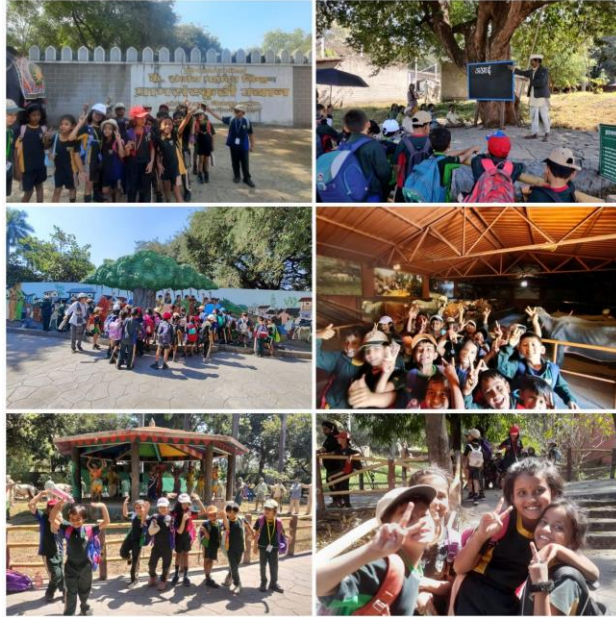
Experiential Learning in the PYP - Field Trips