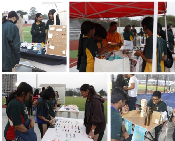
Fete-e-Fete on Sports Day

Pegasus house went to 'Sahjeevan' old age home as a part of "Old is gold" initiative. They believe that there are lots of benefits of intergenerational relationship . Knowledge and understanding of ethnic heritage, sharing of wisdom can help to reduce loneliness and depression in the elderly and an opportunity to learn new skills for both.