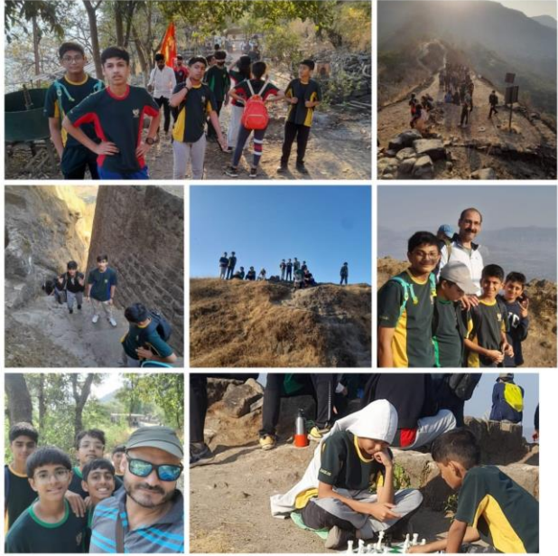
Tikona Fort Trek