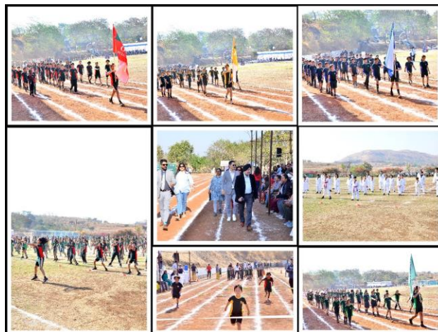
PYP ANNUAL SPORTS DAY