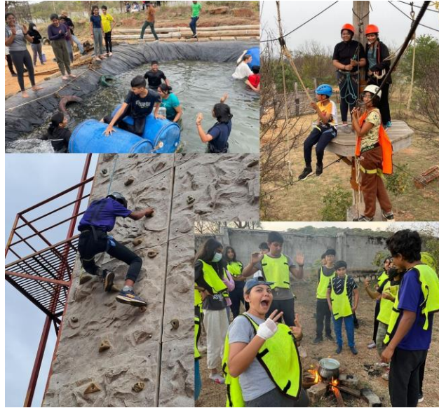
MYP 2 & MYP 3 ISL Camp

A mixed batch of MYP 2 and 3 students went for their ISL camp in Bangalore between 31st Jan and 4th Feb. It was a first time experience for most of them as they both stayed away from home and also engaged in the activities that makes ISL a memorable and joyous experience. They came back with a wide variety of stories and experiences, already looking forward to their trip next year.