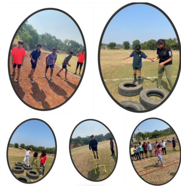
Fitness challenge which included different activities was arranged for all grades. This encouraged students to show their best skills.