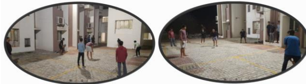
Weekend Night Games

The night of 19th and 26th was spent outdoors by some of the senior boys playing underarm cricket. Making good use of the courtyard, the students and houseparent were enjoyed themselves.