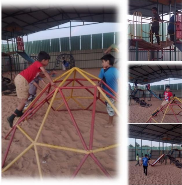
The students of PYP decided to make their weekend more fun by going to the Jungle Gym in the academic block